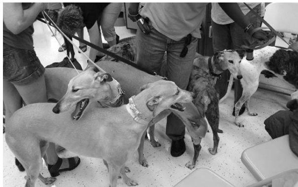
A gaggle of Greyhounds at Temple Petco GPA-CT Meet & Greet

On Saturday, September 20, Austin area members of GPA-CT traveled up the road a piece to meet with Temple members at their monthly Meet & Greet at Petco. At least seven foster dogs made the trip, with human friends, to meet the public. Several board members were there, as well as foster moms for some of the dogs wearing "slime lime" collars and leads. Recently adopted dogs in the area also came out with their new owners.